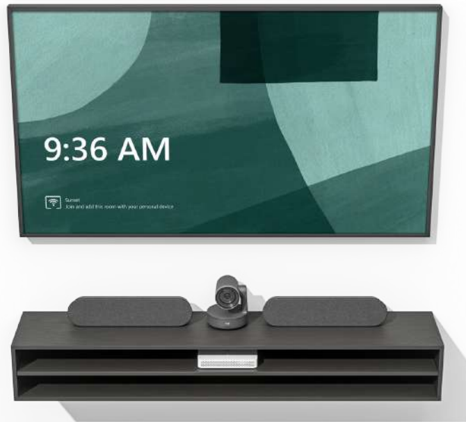
Logitech RoomMate shown with Rally Plus system