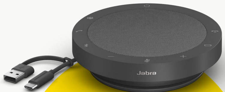
MS TEAMS & UC VARIANTS

We consider sustainability carefully at every stage of product development. The casing of Speak2 55 is made with over 50% sustainable materials**, and has a number of built-in parts that can be repaired or replaced. Better sustainability = longer speaker life = great calls for you and your team for years to come.